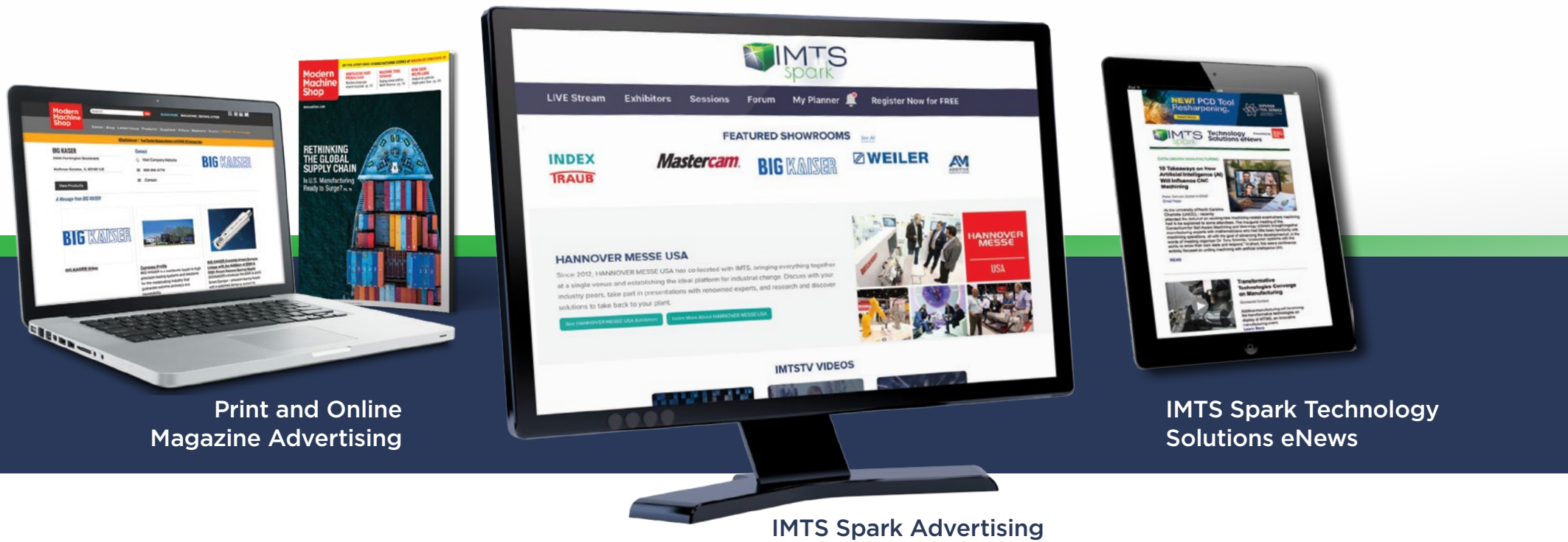
Print and Online Magazine Advertising

Getting your message in front of prospects where they go for industry and event information drives them to your IMTS Spark Showroom and company website.