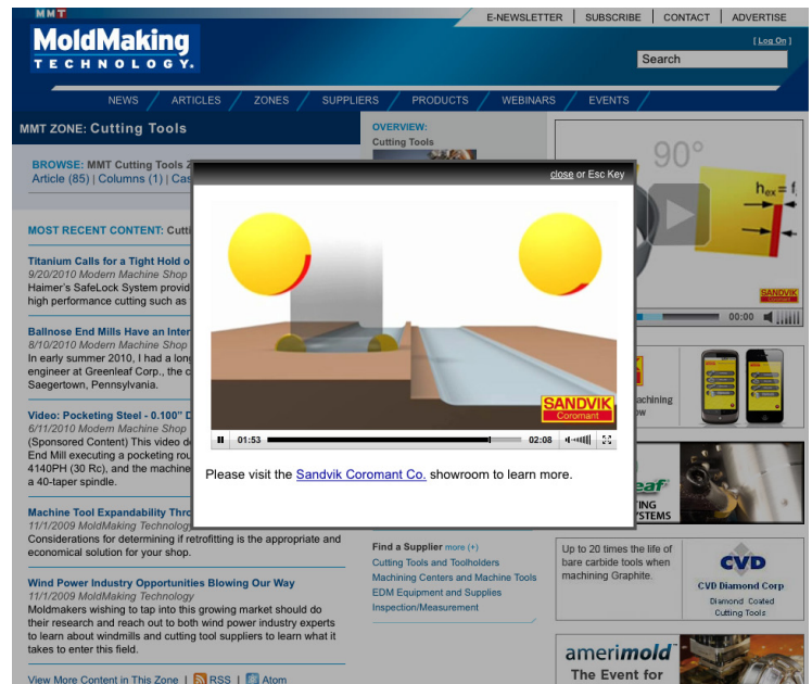
EXAMPLE OF VIDEO PLAYBACK